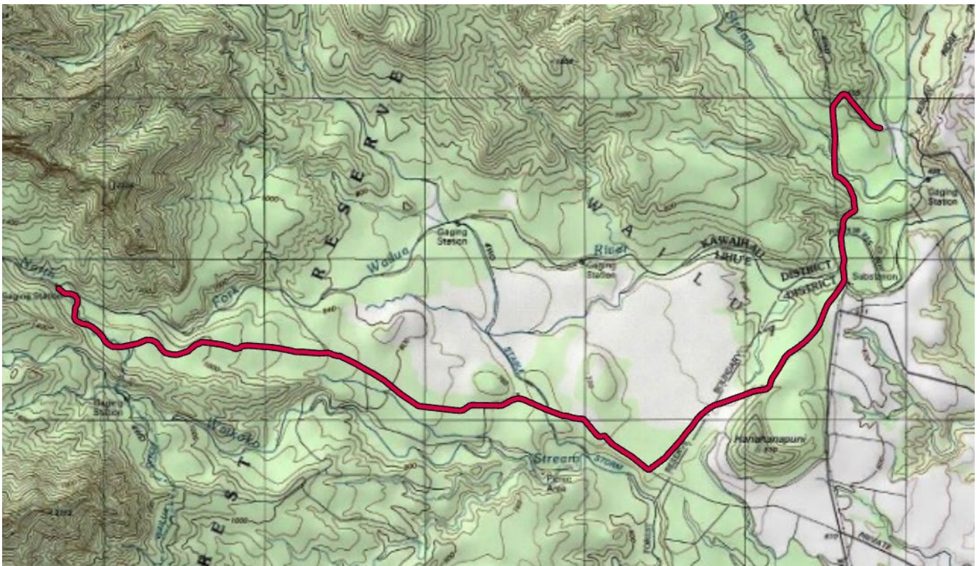
Figure 3 – Map of Loop road

There have been repairs to the major crossings along this road, but a lot of work remains. Ditches are full and the throw-aways and waterbars are no longer functioning. Water remains on the road, eroding it away quickly. Aggregate will be needed to repair and strengthen the integrity of the road, especially the sections beyond the “Jurassic gate.” One section, the “Black Pond” will not need addressing, except for repairing and touching up the approaches. The actual water crossing will be a separate project that requires designs and permits. It is safe to cross with heavy equipment and vehicles, but all shall proceed with caution so no further damage to the area is made.